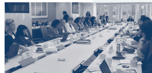
CONSORTIUM FOR Advancing Women Lawyers

This year's Consortium event featured almost 40 participants from more than 20 organizations.